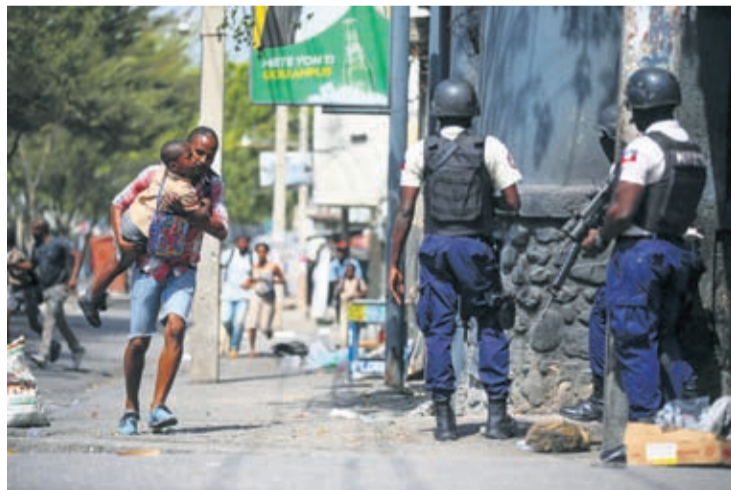
A parent, carrying his child after picking him up from school, runs past police as they carry out an operation against gangs in the Bel-Air area of Port-au-Prince, Haiti, Friday, March 3, 2023.

of victims ranging from U.S. missionaries to a hot dog street vendor in a bid to control more territory, with violence worsening since the July 2021 assassination of President Jovenel Moïse. "It is urgent for the OAS...to understand that the worsening security situation on the ground has reached its peak, and armed gangs now roam the country unfettered," said Victor Génés, Haiti's foreign affairs minister. Top Haitian officials including Génés and Prime Minister Ariel Henry have repeatedly sought international boots on the ground, a request first made in October that has gone unheeded by the U.N.'s Security Council, which has instead implemented sanctions. □